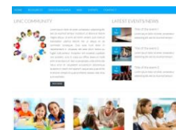
The LINC Community

LINC community: http://community.linc-project.eu/