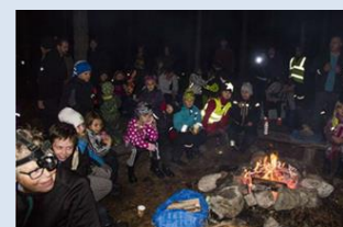
A magic night in the forest in the context of the Stroll activity in Sweden.