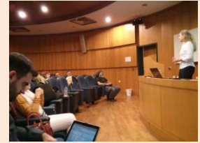
'Mobile and Game-based learning' event

In addition with the support of the University of Thessaly public relations office, a press release on the LINC project, its objectives and related outcomes has been sent to 22 newspapers and other local media in Greece in November, 2015. LINC ideas have also web presence . LINC publications are available to thematic portals and databases such as Scientix online platform that is well known among European research and school communities, Photodento that aggregates educational material available for the Greek school community, the Panhellenic School Network portal, which is broadly accessed by the primary and secondary education community in Greece and more as well as through social network services.