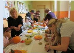
Parents and students are working together on creative tasks in Czech Republic.

“It was interesting to be at school during school hours, to meet with the teachers, students and parents. I got to see the parents from my daughter’s class which I had never met”.