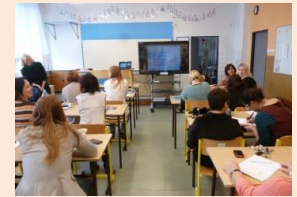
Exploitation Event in ZSPlanany School