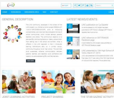
The LINC Social Networking Community

The home-school partnership is further enhanced through the LINC social networking community which was launched in the fall of 2014. The LINC community aspires to become an additional on-line “meeting point” that provides incentives for parents, teachers, and learners to become further engaged in the school community.