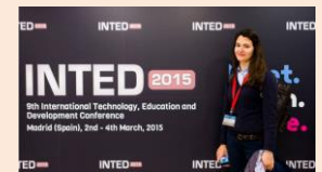
Project member in INTED 2015 Conference