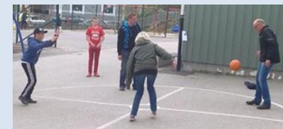
Action in the context of the reversed sports lesson in Sweden.

“An incredibly fun sports lesson that I hope we will do again”