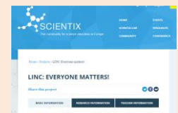
LINC on Scientix Online Platform