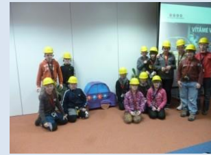
ZSKolin students to the TCPA company in Czech Republic.

Inspired by the resources that were becoming available in the LINC community, Swedish teachers designed and deployed the ‘ Self-evaluation ’ activity in the context of which 128 learners were periodically being asked to complete a self-evaluation form. At a later stage the students were encouraged to talk about their self-evaluation forms in a meeting with the presence of the parents and the teacher. The meeting did not have a judgmental character; both parents and teachers held an advisory and supporting role. This activity attracted the interest of the school community members who expressed the opinion that this practice engages students in a “developmental dialogue”. The parents also seem to realize that there are many benefits that arise from this practice at personal, psychological and educational level.